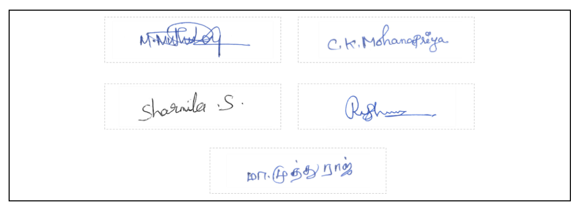
Table 6B: Samples of not Acceptable Signatures